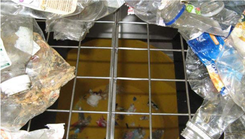
Figure 2 - Example of a sort screen